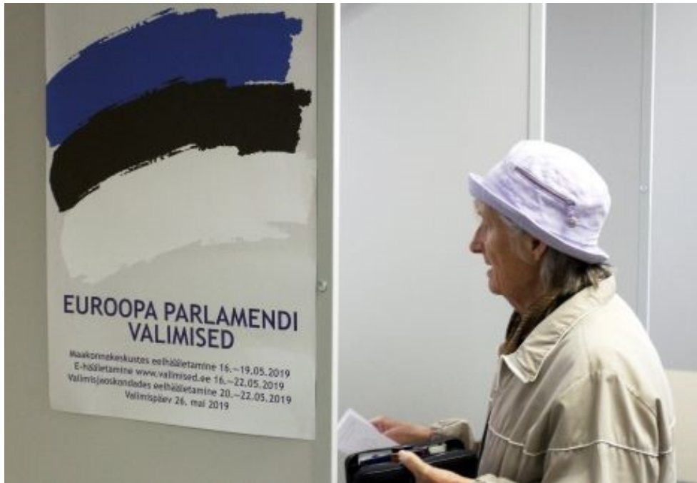
Voter at a polling station during the 2019 European Parliament elections in Parnu, Estonia.