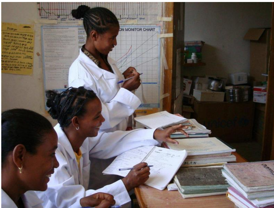
Three Health Extension Workers from Gondar Zuria Woreda, Maksegnit town. Amhara.