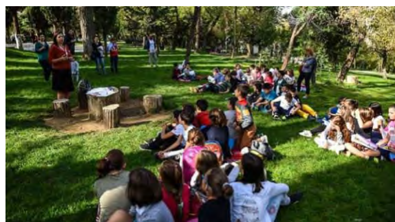
Figure 3: Grand Lake Park Credits: City of Tirana, Startek Constructions , Visit-Tirana.com