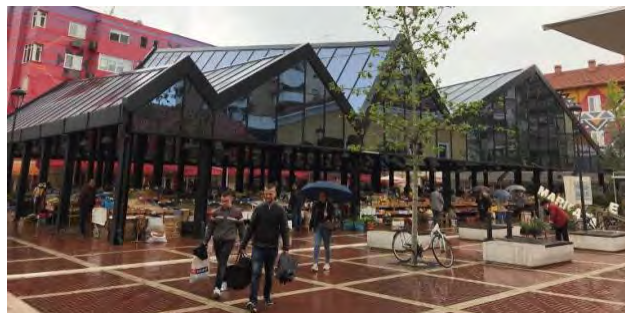
Figure 6: New Bazaar, Credit Gabriel Kuris

In 2016, the city renovated and pedestrianized Pazari i Ri—the New Bazaar—a farmers market built in 1931 that anchored one of Tirana’s oldest neighborhoods. The redevelopment added seating and public art to attract local families and tourists to the area’s shops, cafés, and eateries (figure 6).