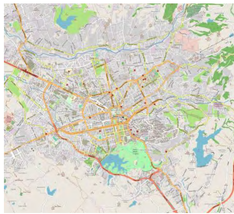
Figure 2: Tirana streets map

After a quarter century of unplanned growth, Tirana had overcrowded schools, overgrown parks, crumbling sidewalks, and congested streets. (Figure 2) Children generally played in the streets or in private playgrounds in cafés and shopping malls. A 2018 survey of parents of preschoolers, conducted by Qendra Marrëdhënie, a nonprofit based in Tirana, found that although 62% of respondents preferred that their children play in parks and playgrounds, only 7% lived close to such public spaces. 1