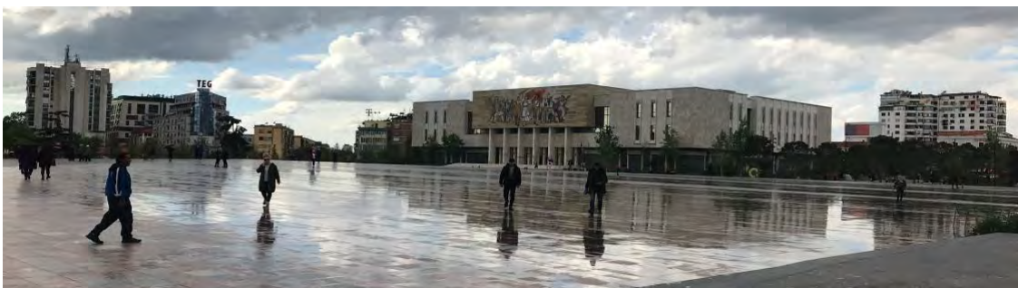
Figure 5: Skanderbeg Square

“In the morning, it was a complete PR disaster,” he said. Driver complaints about the rerouting overwhelmed the communications team. But the children