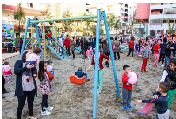
Figure 4: Before & After