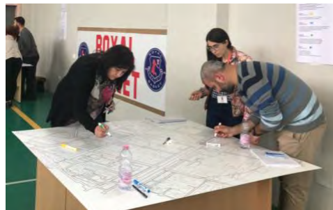
Figure 1: ITC workshop

Over a series of mornings in early 2019, city planners, architects, engineers, and other municipal officers met in the gymnasium of a newly renovated school to rethink their city—Tirana, Albania—through the eyes of a child. Gathered around tables laid with scale maps of two primary schools and their environs, the group sketched out plans to make the city’s neighborhoods safer, healthier, and more comfortable for infants, toddlers, and caregivers. Where would benches and trees best provide for shady rest or snack breaks? Was it possible to calm the traffic? to lessen noise? to reduce danger? What kinds of objects or terrain would prompt children to think and to play? (Figure 1)